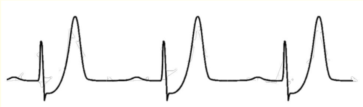
Figure 2: Electrocardiographic pattern representative of the De Winter T waves.

The De Winter ECG pattern was reported in 2008 by De Winter, et al. [12] and it's considered an anterior STEMI equivalent, meaning an acute LAD coronary artery occlusion [1,5,8,13]. This ECG pattern is characterized by a 1 - 3 mm upsloping ST-segment depression at the J point with tall and positive T-waves in precordial leads (V1-V6) (Figure 2) in most patients it's also present a ST-segment elevation at the J point of 0,5 - 1 mm in AVR, mild ST-segment depression in the inferior wall derivations and normal or slightly elongated QRS intervals [1,3,4,8,12-16].