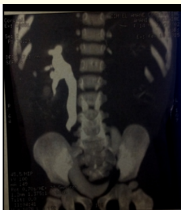
Figure 3A1: URO-CT scan.

At 14 months of age, the patient underwent an intra-vesical cross-trigonal ureteroneocystostomy combined with extra-vesical dissection and posterior uncrossing the right ureter of the right external iliac artery (Figure 3). The postoperative course was uneventful.